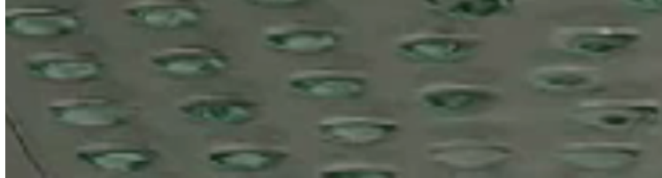
Figure 4: Gravity-induced instability of a thin film of liquid.

An enthusiastic amateur chef notices that there is a slick of bacon fat on the ceiling above his stove that looks roughly as shown below. He terms the resulting undulations ‘stalardtites’, and wonders if they will ever drip. A graduate of 18.357, he is lead to consider the following problem.