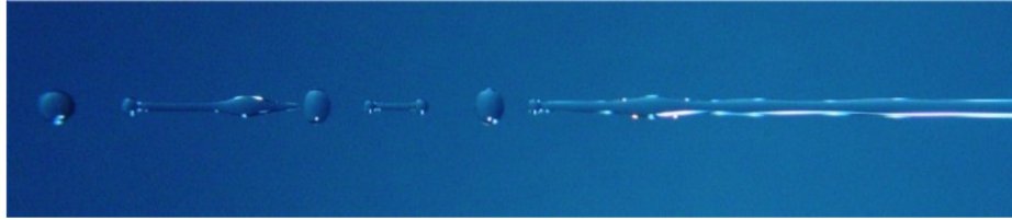
Figure 3: Breakup of a fluid thread

Consider a fluid that initially assumes the form of a cylinder of radius a with hemispherical caps. Neglect the influence of gravity.