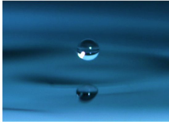
Figure 5: Droplet bouncing on a vibrating bath of silicon oil.

Consider a drop of diameter 1mm bouncing on a fluid bath at 50Hz, rising a few diameters above the interface and distorting the interface by approximately 100 microns on impact.